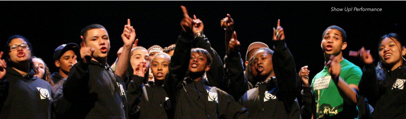
Show Up! Performance

The ENACT program delivers a customized curriculum focused on teaching social & emotional skill-building and restorative approaches resulting in behavior change and personal transformation.